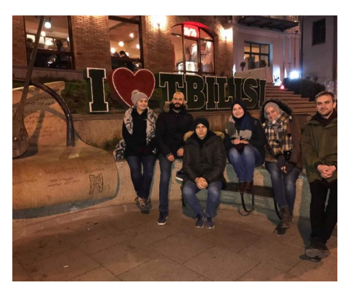
Bosnian group in Tbilisi, visiting the city

"While having tons of fun, I was developing real life skills, that I didn't even notice. Intercultural communication and communication itself are the ones I would emphasize, being constantly surrounded by people from all over the world, you are getting out of your comfort zone, and there is nothing odd or uncomfortable about it. Having diverse groups in YEs, we are given an opportunity to grow in new ways, because we are becoming more dynamic, flexible and better educated as an individual."