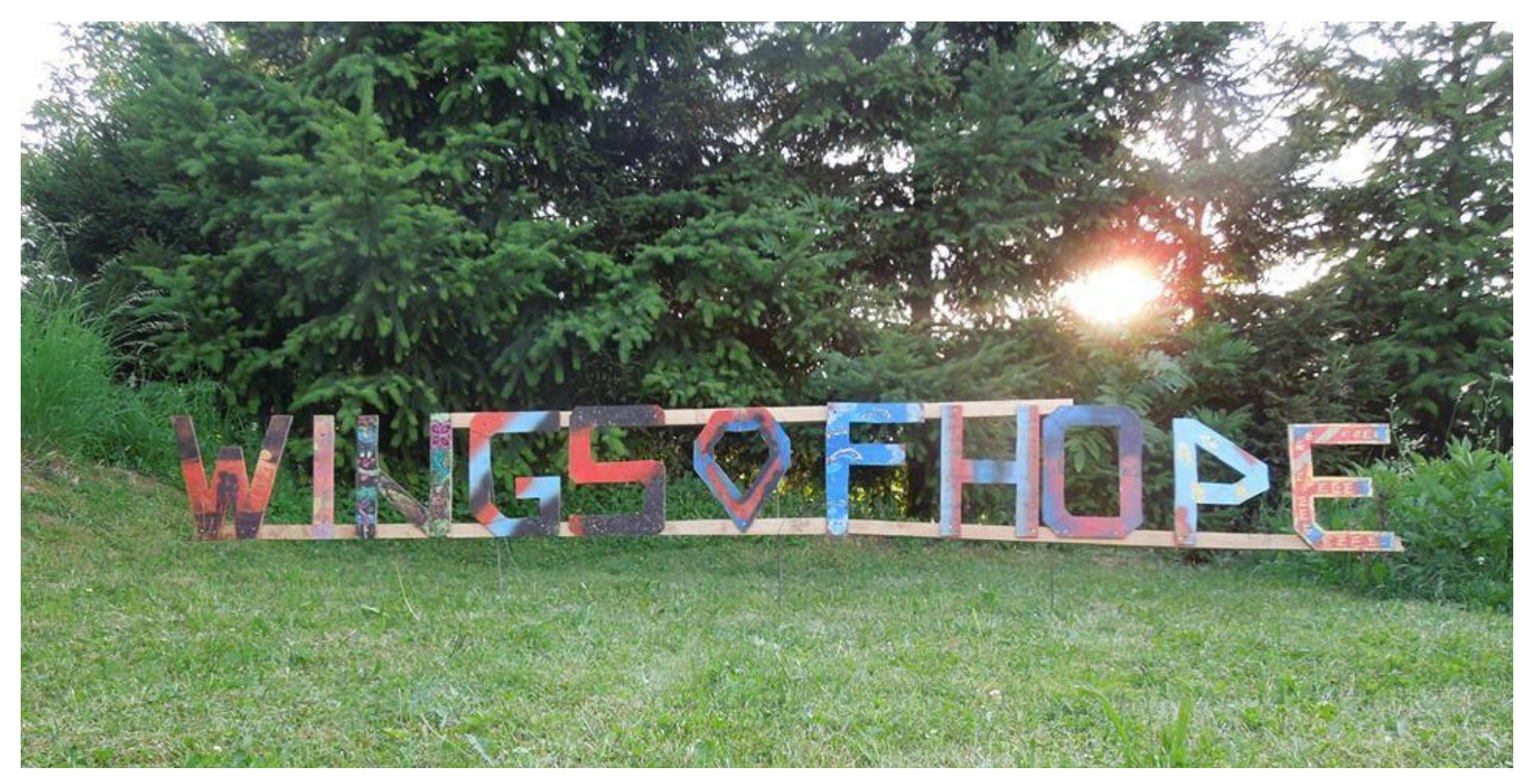
Thank you for your readership of Krila nade news. Our Facebook has all the latest news until the next issue at the start of next year.

Additional as part of our work under Erasmus+ she participated in the meeting organised by SALTO SEE together with all EVS accredited organisations form Bosnia and Herzegovina, Montenegro and Serbia, after which she participated in the Conference "Erasmus+ opening doors" in Novi Sad, to establish structuring dialogue, networking and synergistic influence on improving the position and opportunities of the youth in Balkan countries.