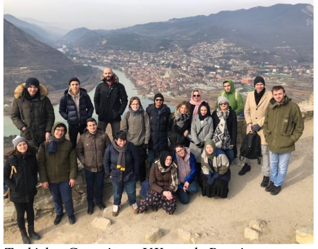
Turkish, Georgian, UK and Bosnian groups together

In January we sent 7 Youth Participants to Tblisi Georgia for the third in a series of four youth exchanges.