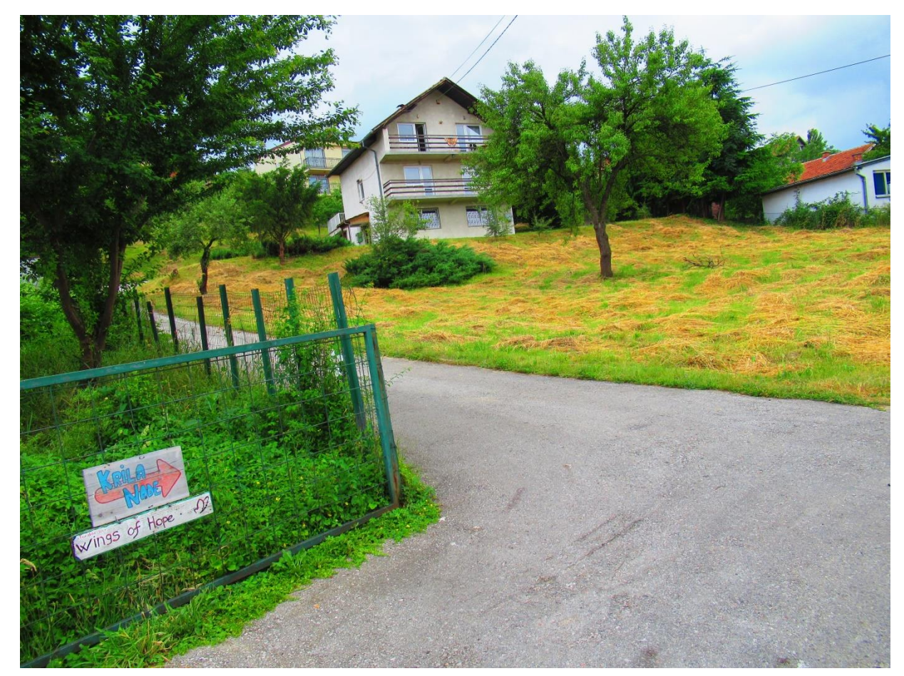
Wings of Hope Centre, Sarajevo