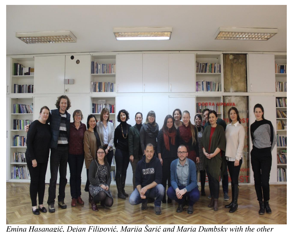
Buildpeace collaborators in Belgrade, Serbia.