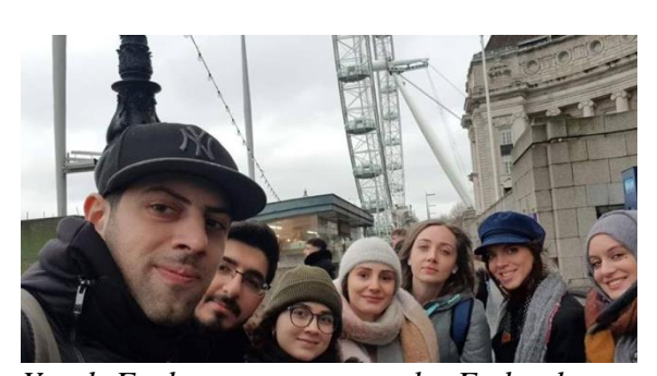
Youth Exchange group on the Embankment next to the London Eye

"During my exchange in London I had the opportunity to meet youngster from various parts of Europe and wider, which enhanced my knowledge on cultural-sensitivity skills, effective communication and team work. Out of our comfort zone, with a group of unknown people in an unknown country, we grow and we learn more about ourselves, and I consider that every fear we overcome is a huge step forward, and particularly this process of learning about ourselves is the most important one."